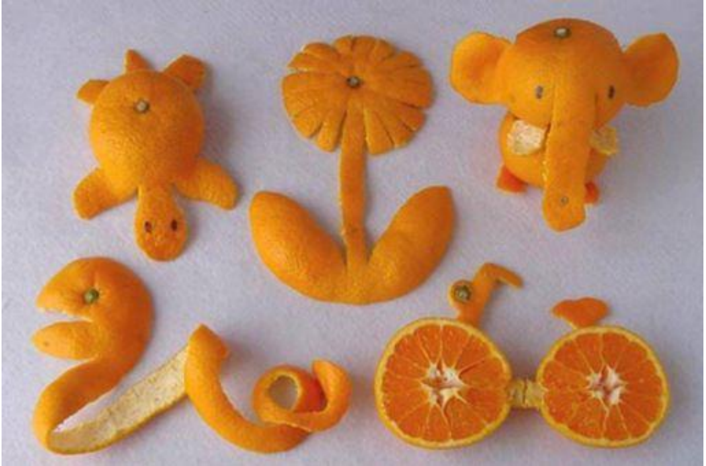
(orange peel art)

Tuesday evenings at Emanuel 6:30PM to 8PM in the Fellowship Hall